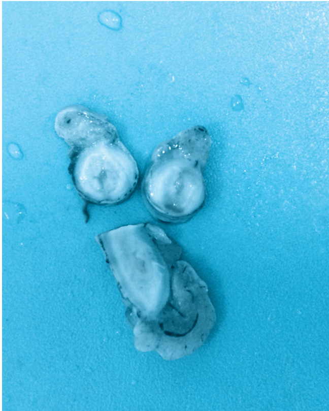
Figure 1 : Gross specimen showing focal yellowish discoloration of the mucosa and patent lumen