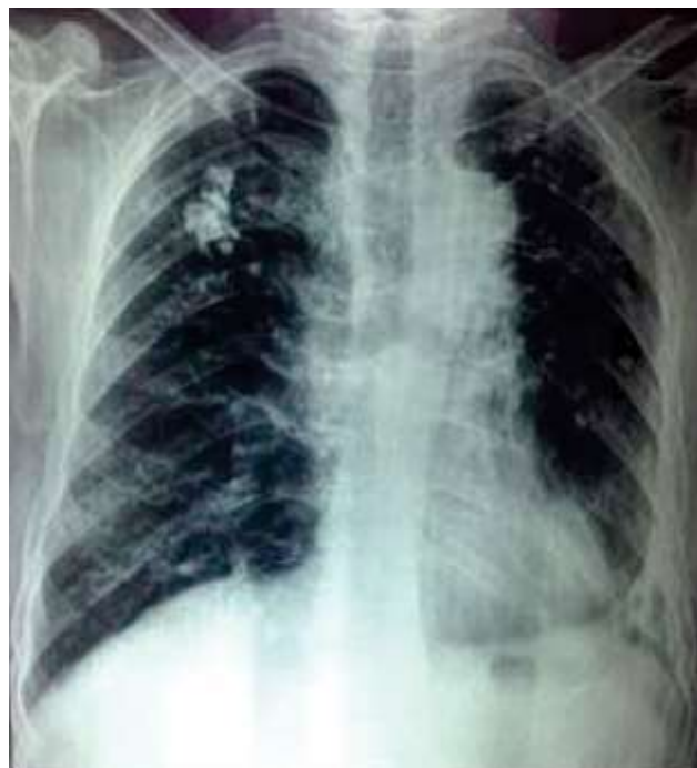
Figure 1: Bilateral lower lobe infiltrates

X-ray chest showed bilateral lower lobe infiltrates. The cardiac silhouette was normal.(Figure 1)