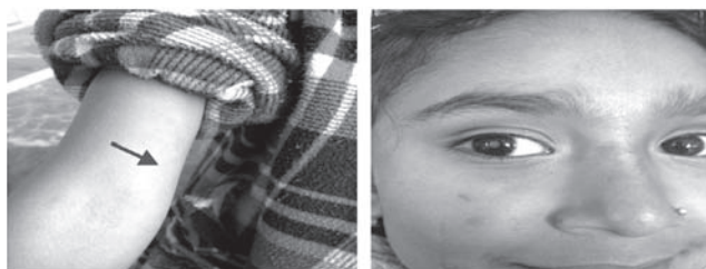
Figure 1 Subcutaneous nodule, Figure 2 White papillary reflex

Her neurological assessment was intact with no cranial nerves (except for vision acuity in the right eye), motor and sensory deficits. Rest of the systemic examinations was also normal.