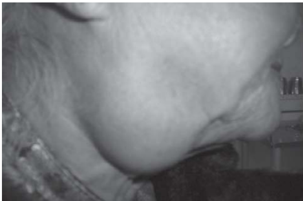
Fig.1. Warthin's tumour in the right submandibular region

Although extraparotid Warthin's tumour is extremely rare, it should also be considered as a differential diagnosis in a typical swelling of the submandibular salivary gland prior to definite treatment. Complete excision is the treatment of choice.