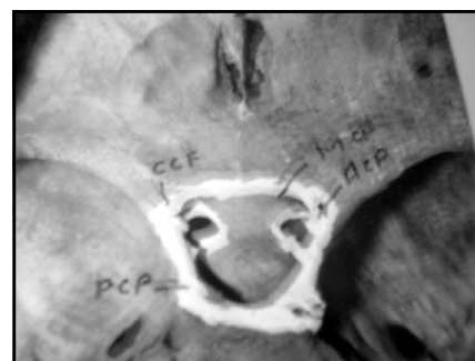
Fig. 2 Showing complete osseous ring of Sella Turcica showing Carotico Clinoid Foramina on both side and complete interclinoid bar of bone on both sides.

bone was seen only on right and absent on the left side (7.69%) where there was no interclinoid bar of bone connecting anterior clinoid process and posterior clinoid process ( Fig. 2 ).