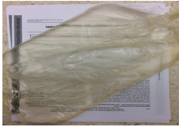
Figure 2. Clear peritoneal effluent

Abbreviations: ANC: Absolute neutrophil count, PD: Peritoneal Dilaysis, TLC: Total leukocyte count, mEq/L: milliequivalent/liter, mmol/l: millimoles/liter, mm: millimeter, µmol/l: micromoles/liter