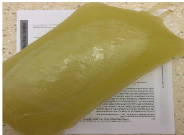
Figure 3. Cloudy peritoneal effluent