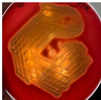
Figure 5. Isolates of Staphylococcus aureus showing beta hemolytic colony blood agar