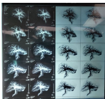
Figure 1. MRCP showing Strasberg E3 BDI

Patients with index presentation were classified according to Strasberg classification. 6 After thorough evaluation, decision to whether manage by surgical, percutaneous intervention, or endoscopic intervention was based on clinical condition and imaging findings. Surgical management was done with Roux-en-Y HJ by Hepp-Couinaud technique for patients with index presentation. For patients with stricture post HJ for BDI, surgical management was done with Redo Roux-en-Y HJ (Figure 3). Percutaneous interventions were done by team of intervention radiologists (IR) with percutaneous transhepatic biliary drainage (PTBD) and dilatation and stenting of stricture as required. Endoscopic management was done with endoscopic retrograde cholangiopancreatography (ERCP), sphincterotomy and stenting. 7,8 Early outcomes in terms of